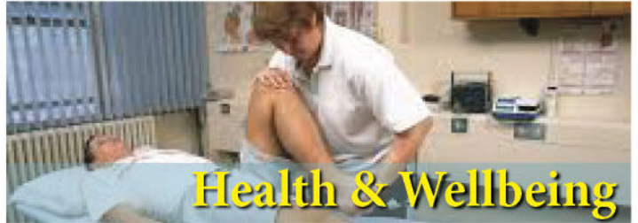
Health & Wellbeing